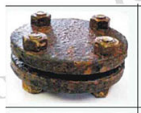
After using Cargo Guard