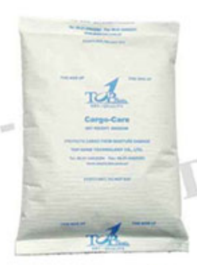
Cargo Care -500