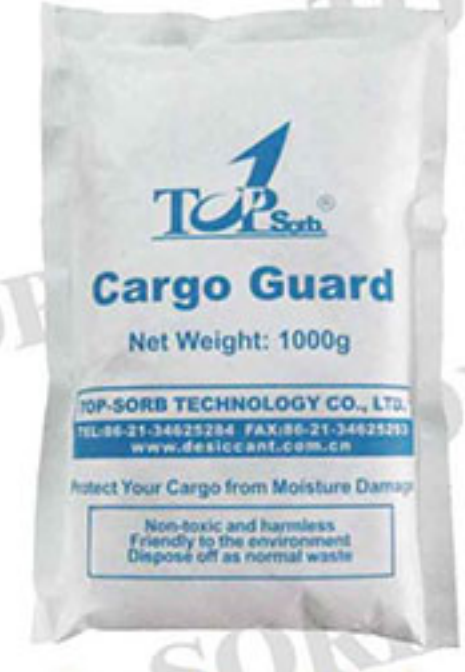
Cargo Guard -1000