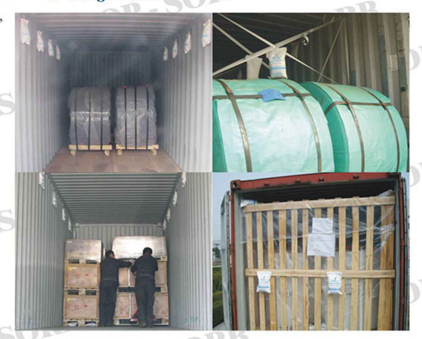
TOP-SORB, Moisture-proof Expert of Container Cargo! Deliver Your Goods In Perfect Conditions!