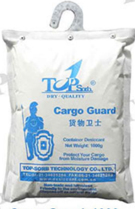
Cargo Guard -1000 (with hook)